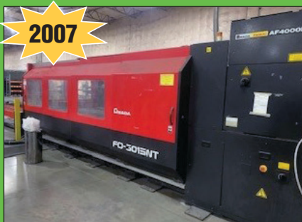
Amada FO-3015NT CNC Laser