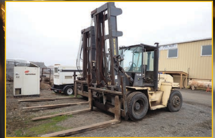
2000 HYSTER H190XL

James G. Murphy Co. - Murphyauction.com - 425.486.1246