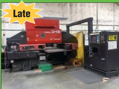
Amada Pega 345 CNC Turret Fabricator