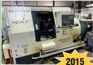
Eurotech Elite B545-YS CNC Turning Center