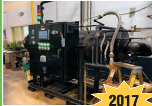
Atmosphere Engineering A11636 Exothermic Generator