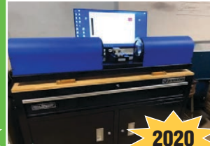
Oasis COREX2-12096 Optical Inspection System