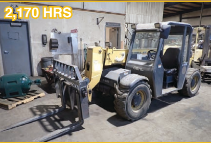
2017 GEHL RS5-19