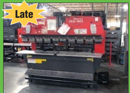
Amada RG-50, 50-Ton Power Press Brake