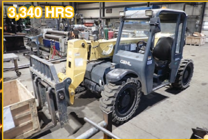
2013 GEHL RS5-19